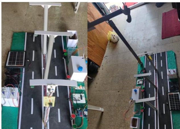
Fig.3 Project Development

In adverse weather simulations and nighttime tests, the battery power supply provided uninterrupted operation, validating system reliability. The soil moisture sensor effectively controlled a miniature water pump, while the GSM module successfully transmitted alert messages during emergency switch activation. Quantitative results showed an approximate 40–50% reduction in energy consumption compared to a traditional highway lighting system. The integration of renewable energy with intelligent control not only ensured sustainable operation but also improved road safety through automated alerts and adaptive illumination.