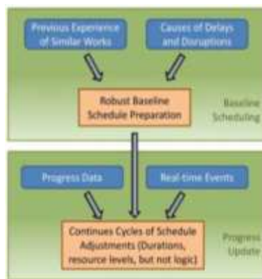
Fig. 2 Robust pro-active scheduling

Predictive-reactive scheduling is the most common dynamic scheduling approach used in manufacturing systems. Most of the definitions reported in the literature on dynamic scheduling refer to predictive-reactive scheduling.