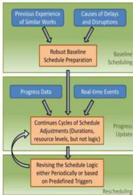
Fig. 3 Predictive-reactive scheduling