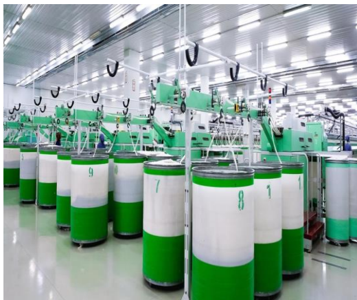
Fig. 2. Spinning Machine

Automation has been achieved in spinning by the invention of machines like ring spinning, air-jet spinning, rotor spinning, Vortex spinning etc. Improvements in Ring spinning machines have taken place through drive systems, drafting systems and use of robotics. Yarn fault detection has been automated now to improve the production and to get the uniform yarn quality. Yarn knots have now been replaced with the joints using splicing techniques like air splicing, wet splicing, hot air splicing and moist air splicing which minimizes the defects in final fabric thus produced. Transport automation is done using robots to carry out heavy takes which were earlier done by humans. Package collection from the spinning mills and even palletizing and packaging is being done these days using automated solutions. All these automation in the spinning process has reduced the need of the skilled manpower.