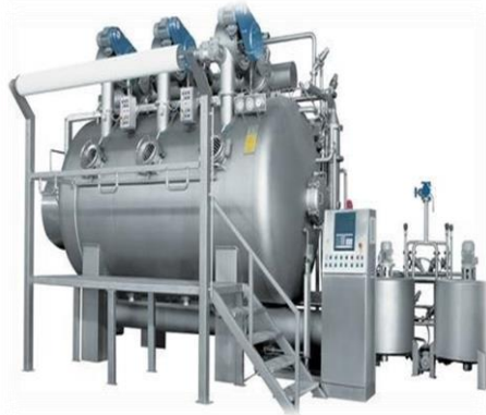
Fig. 4. HT Synchron Airjet Fabric Dyeing Machine