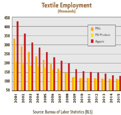
Fig. 5. Textile Employment in US