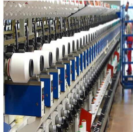
Fig. 3. Weaving Factory

filling colours, break detection data collection etc. which has helped in improving the production as a lesser labour cost.