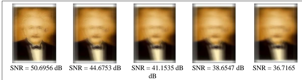
Figure 1: The visual acuities corresponding to deviations of the reconstructed wavefronts are shown.

In clinical practice, multiple measurements should be taken from a patient in each sitting using an aberrometer. However, multiple measurements cause to induce the variation on measurements. This variance is significant and should be taken into account to find the single reading for a patient. Also, aberrometer misalignment leads to create