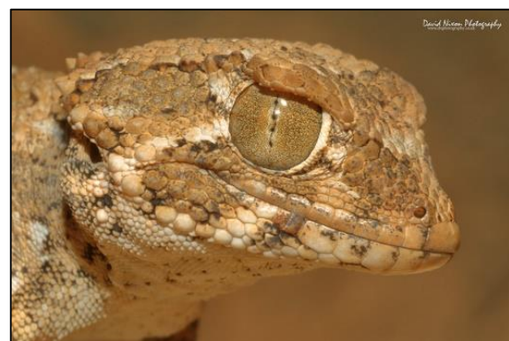
Figure 3: Nocturnal Gecko ( Tarentola chazaliae ) eyes

Tarentola chazaliae , the nocturnal helmet gecko, actively works in dim moonlight when humans are color blind. At the color vision threshold, the sensitivity of the helmet gecko eye was measured to be 350 times greater than that of human cone vision. The gecko's optics and large cones are significant reasons for using color vision at low luminous intensities[13]. Use photorefractometry and a high-resolution adapted Hartmann – Shack wavefront camera, we also demonstrate that the helmet gecko's optical system has distinct localized zones of different refractive powers, a so-called multifocal optical system. The intraspecific variability is great, but the zones varied by 15 diopters in most individuals studied. This is of the same magnitude as required to concentrate light on the wavelength range to which the most sensitive gecko photoreceptors are at. We equate the helmet gecko's optical system to that of the Phelsuma madagascariensis grandis , a diurnal day gecko. The day gecko's optical system shows no signs of distinct concentrated zones and thus is monofocal[14].