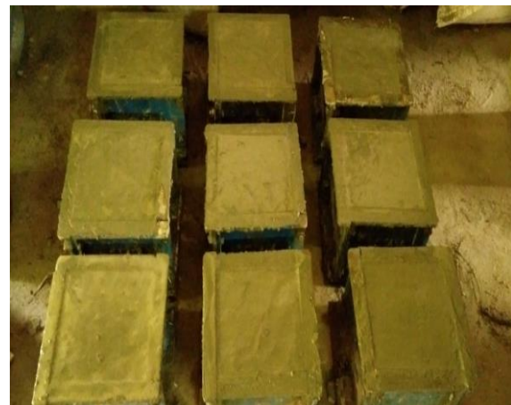
Fig: 1 Cube Test Specimen

The concrete mix is mixed with the partial replacement of coarse aggregate with 0%, 10% and 20% of plastic waste. Then cement and fine aggregate is mixed initially, followed by addition of coarse aggregate and plastic waste. After this, super plasticizer is added in the required quantity of water. Now, the super plasticizer mixed in the water is added into the concrete. The concrete mix is filled in mould in 3 layers. Each layer is tamped by 25 blows.