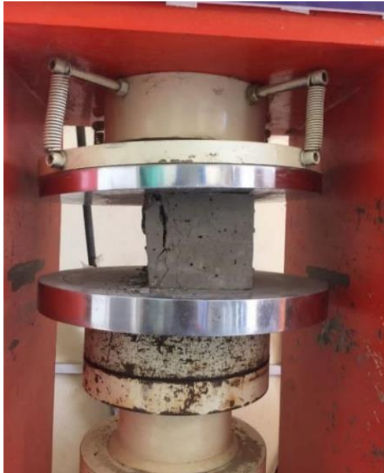
Figure: 1 Compressive Strength Testing

A=Surface area of specimen in \text{mm}^2