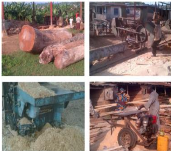
Fig. 2. Activities that generate wood waste in a typical Nigerian sawmill (Babayemi and Dauda, 2010)

About 1.8 million tons of sawdust was estimated to be generated in Nigeria yearly (Sambo, 2009), while about 5.2 million tons of wood residues were reported to be generated (Francescato et al. , 2008). Due to improper disposal methods, these huge quantities of waste are burnt in open fire, dumped in drainages or along the bank of streams and rivers, or left on any available space to rot. Fig. 2 and Fig. 3, show the activities that generate wood waste and local collection and dumping of wood waste respectively in a typical Nigerian sawmill.