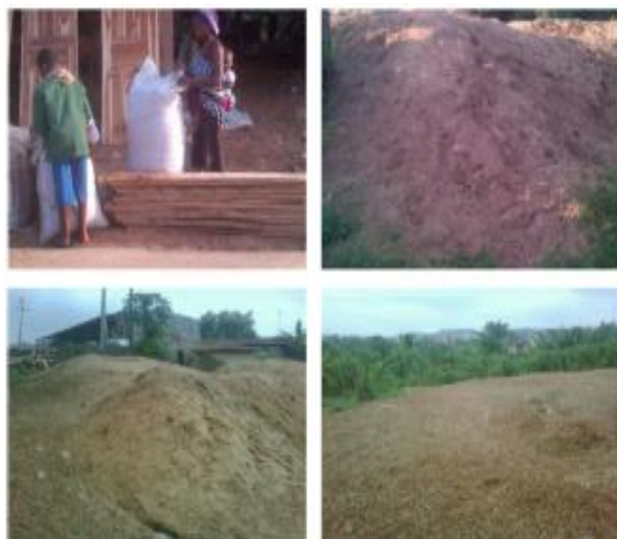
Fig. 3. Local collection and dumping of wood waste in and around a Nigerian sawmill (Babayemi and Dauda, 2010)