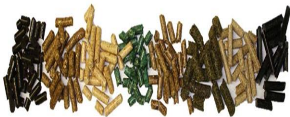
Fig. 1. Examples of pellets from different materials and processes (Source: Thrän et al. , 2017)

This solid fuel is actually mainly produced by wood residues but could also be produced by mixed biomass residues through a quite simple process of milling, drying and compacting. The main advantage of compaction is the high density of the product in comparison with the other unprocessed biomass. It also enables the production of a standardized fuel and reduction in the cost of handling, storage and transport (Hansen et al. , 2009). Today, there are different pellets available from different sources and qualities; wood pellets, agropellets, torrefied pellets etc (Fig. 1).