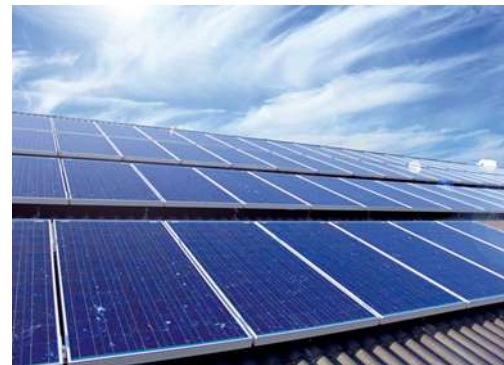
Figure1: solar panel

Photovoltaic cells are crystal diodes that are made up by semiconductors with photoconductive properties. The use of silicon is the most common, since it is quite inexpensive and therefore used for the construction of semiconductors [1]. Theoretically, a common photovoltaic cell can absorb around 25% of the energy that reaches it. Practically, though, the most common percentages noted are less than 15%. [2]