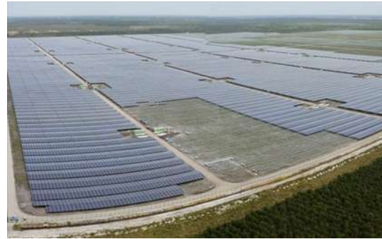
Figure3: Cestas photovoltaic park, connected to the network

Photovoltaic systems which are connected to the electricity network get from it the required power supply that cannot be covered. As a result, there is no need for storage of the electrical energy produced. Depending on the design of the system, the network can operate not only as an auxiliary source of energy, but also interact with it. In the second case, the system is capable to cover the energy requirements of the application throughout the year. Ideally, it can produce same or maybe even more amounts of energy than the percentage of energy headed from the network to the application.