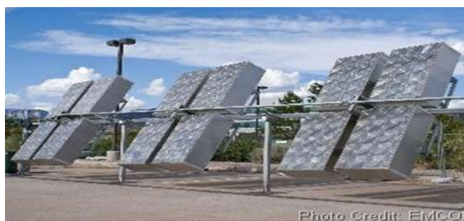
Figure 4: Photovoltaic example

In this way, all centralized flow will "hit" the photovoltaic cell resulting to the production of a percentage of electrical energy. The total of this produced thermal energy will penetrate the cell with the help of the saddle and afterwards it will flow through the heat pipe, distributing eventually from each heat pipe to a total of fins where it will be extracted with natural transmission.