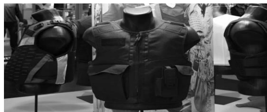
Fig.1: Kevlar®bullet proof vest

binds the fibers together. In particular, nonwoven fabrics have been effectively utilized in multiple ballistic protection industries. This is attributed to their high flexibility, lightweight and high energy absorption capability [5-7]. A scientific article published by the US Army researchers showed that the Kevlar® (Fig.1 ) needle-punched nonwoven provides around 67 % less structural weight than the woven fabric, while maintaining over 80 % of the ballistic protection capability of the woven fabric. In nonwovens, it has been concluded by many researchers that the modulus of fibers plays the most vital role in ballistic protection. Kevlar® nonwoven fabrics provide higher energy absorption ability compared to the other types of nonwoven fabrics. Previous studies showed that the energy-absorption mechanism of needle-punched fabrics is different from that of the unidirectional fabrics or even woven fabrics where the energy is dissipated in terms of fiber breakage [8,9]. On the contrary, there are less fixed and short staple fibers in needle-punched fabrics that can reflect the strain waves. Hence, less fibers failure occurs in nonwoven fabrics.