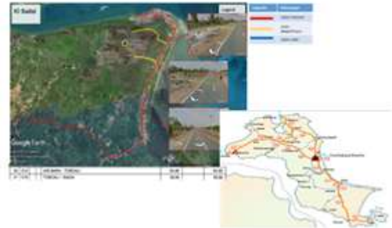
Figure 3 Sadai Industrial Area Road Network

Based on the 2020-2024 National Medium Term Development Plan, one of the strategic areas and major project developments for the Bangka Belitung Islands Province is the development of the Sadai industrial area located in the South Bangka Regency, Bangka Belitung Province.