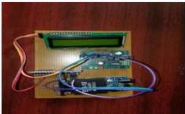
Fig. 3. Smart Trolley Kit

Along with this, there is a 16x2 LCD Display for displaying names and prices of all products along with the amount totalled at hand. The system also contains a Bluetooth module, either HC-05 or HC-06 for wireless communication to a smartphone or a central billing system to make online payments and automatically checkout. The DC barrel jack or battery serves as a power source, while multiple jumper wires connect various components.