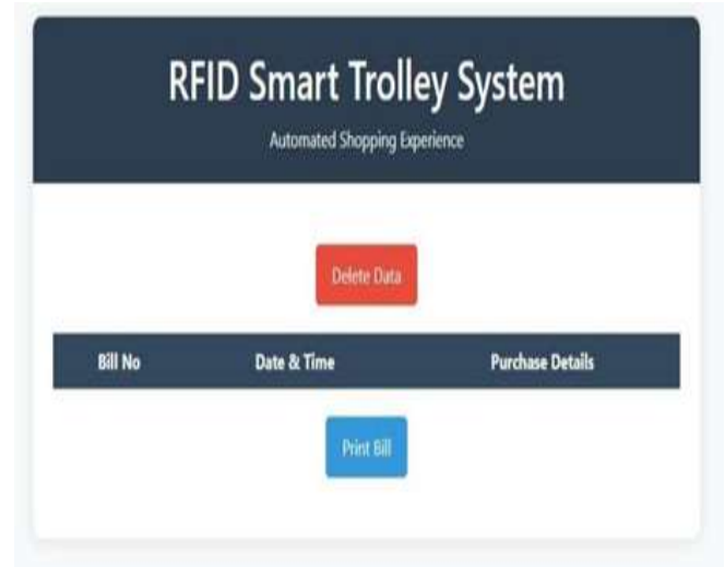
Fig. 5. Billing Page

The three columns of the billing table are Bill No, which is a unique number assigned to a particular transaction for easy tracing; Date & Time, which records the time at which the purchase was made for maintenance of logs of the transaction; and Purchase Details comprise RFID tagged products and the details of the same present in the cart. There also exists a "Print Bill" button on the bottom so that the customers do not have to scan the bar codes at the counter in order to print the final bill. This system is on RFID tags attached to every product carrying unique identification codes.