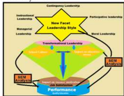
Figure 1 New Facet Leadership Style and Job Satisfaction Conceptual Framework for the Mauritian Education System (Subrun & Subrun, 2022)

The conceptual framework steering the qualitative and quantitative study assumes that the New Facet Leadership Style of the leaders is connected with numerous successful leadership styles put into practice by educational leaders (Subrun & Subrun, 2022) that generates a good working atmosphere, which eventually affects the subordinates' performance by the applying the right leadership styles. Leaders' leadership styles are directly interrelated to the working conditions of the subordinates and their performance. The conceptual framework in Figure 1 is based on the work of Subrun & Subrun (2022) work. It is based on the Mauritian education system of both the private secondary schools and the state secondary schools.