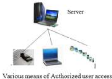
Fig.3.1. Centralized Server data access by authorized users

Typical approach to allow authorized users to access data from centralized server is by giving username and password whenever confidential data is to be accessed from the server. Authentication needs to be provided to the users, who are all accessing it.