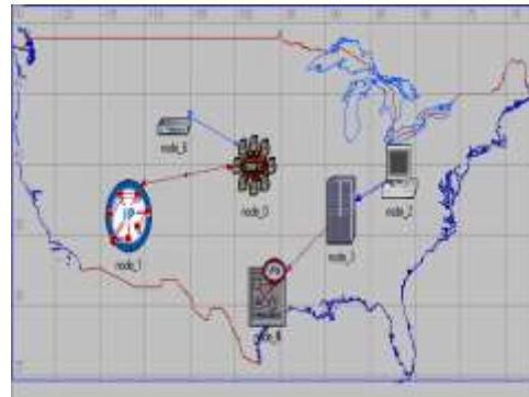
Fig.5.1. Network using OPNET IT GURU simulator to trap data from node_0 to node_3 and node_2.

The sample scenario to trap the network is illustrated in Fig.5.1.