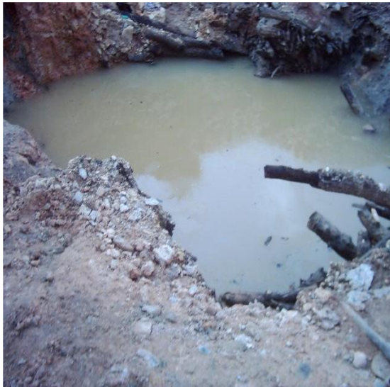
Plate 5: Water in Abandoned Mining Site

The result shows that artisanal mining involves the miners create harmful effects as a result of digging the minerals come in contact with water bodies thereby releasing heavy and poisonous metals contain in the rocks as gangus are deposited (Plates 5 and 6). This might result in polluting the water bodies and the underground water.