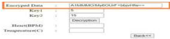
Fig.3. Encrypted Data

examples to show how it successfully encrypts and decrypts the data on the sender and receiver end, respectively.