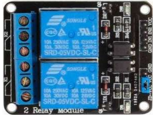
Figure 3: The Power Handling Board

For the selected application with 5V DC excitation chosen ready 2 Relay Module as shown in the following Figure 3 and not a simple DC relay for better protection of the Arduino microcontroller.