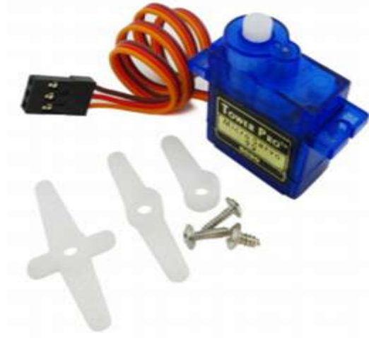
Figure 5: The Servomotor for Lock Operation

We used a motor of TowerPro Micro Servo sg 5010 mini simulating successful user access with a consequent rotation of the motor and the asserted lock opening giving access to the company. If the user is not successfully recognized, the motor does not rotate and there is no access.