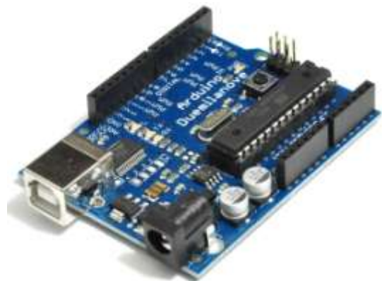
Figure 1: Connecting Servomotor with Arduino

The Arduino Duemilanove is a small microprocessor device (Figure 1) connected with USB to PC. With the Arduino artists, designers, architects, hobbyists, students and college students learn programming and build entire projects for automation and robotic applications. So especially children start learning programming to flash Led into Wiring language like c / c ++ thanks to Arduino. The Arduino board is composed of a small processor open source where one can program even if it is learner through its own free program (IDE: Integrated Development Environment) that runs on Windows, Linux and MAC OS X. The Arduino connected Led, dimmers, ethernet port to become webserver and communication via bluetooth. Because software and hardware is tied, flexible and tested, with the Arduino made applications which interact between computer-user-environment.