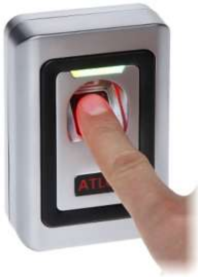
Figure 2: Fingerprint Sensor

Coding together with pretreatment on the export of eight levels of gray is implemented by a microprocessor incorporated in AFS8600 card. According to the specifications of this image type this pretreatment to enhance (optimize) the edges and the fingerprint valley is such that the image be directly implemented feature extraction algorithms.