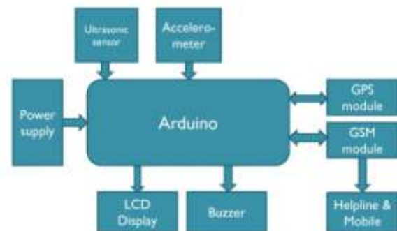
Figure 1 Block diagram of Anti-Collision system using GPS and GSM module

In this system, we make use of GPS and GSM technologies, accident detection and reporting is easy.