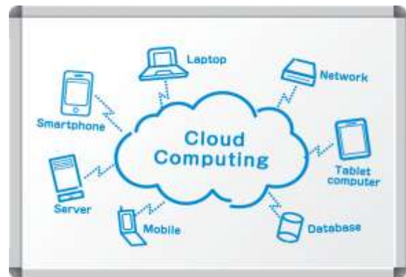
Figure 1-Cloud Computing

Application server (Java, .Net framework) and Database server (My sql, oracle) which client will use to make their own applications. SaaS is available for users through internet and browsers.