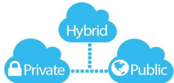
Figure 3- Hybrid Cloud

4.Hybrid cloud is combination of two or more clouds like private , community and public. It has features like Risk transfer and Flexibility.