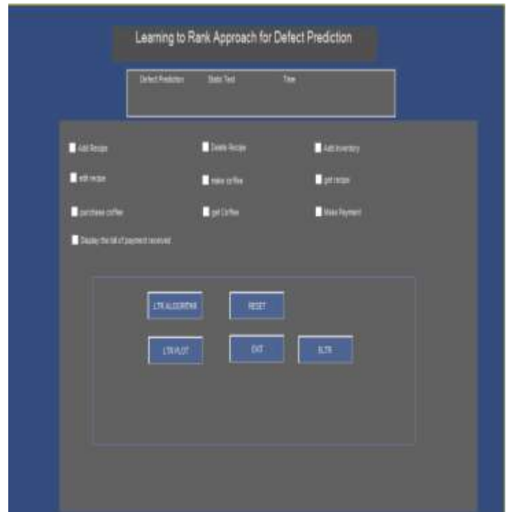
Fig 1: Interface is designed for implementation

The Rank-to-rank and improved Rank-to-learn algorithms are implemented in MATLAB. The