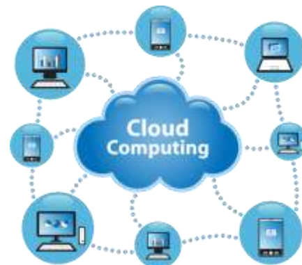
Figure No-1 Cloud Computing

Private Cloud specifies the business services that are not publically available. Basically, Private clouds are a marketing term which is used to provide the services to particular group of people. In other words, the grouping of private and public clouds is known as Hybrid cloud . “Cloud computing is a technology that provides many computer resources like networks, server, storage according to the requirement of user and with a very little management effort [1].