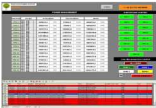
Figure 2 Real time Medium Voltage and Energy consumption for each TPS

SCADA's supervisory functions are result of intelligent devices including sensors and digital relays. For example at the MV field SIMEAS P metric device is responsible for MV indications at each station and energy consumptions.