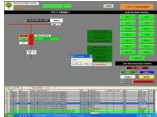
Figure 3 Screenshot of confirmation from user for remote control

Regarding the remote control of the existing SCADA system, it supports the manipulation of the switchgear of the Medium Voltage AC switches. Also supports ccircuit breaker and power switch (HSBC) of the incoming and feeder carriers as well as resetting the SEPCOS card of these carriers.