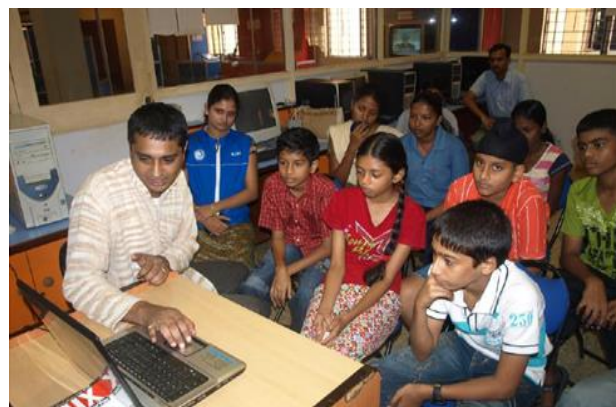
Fig.2: A virtual assistant built on generative AI can assist a teacher in planning unique and engaging classroom activities.

Recognizing the importance of developing AI skills for children, CBSE has introduced AI as a skill module in classes 6–8 and as a skill subject in classes 9–12. Additionally, there are several organizations that are creating virtual assistants for students, teachers, and parents to enable them to learn and teach better. Many such initiatives are now being seen across a diverse set of use cases.