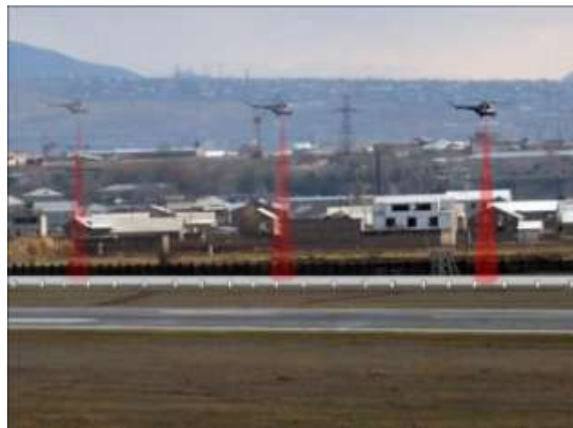
Fig. 3: Helicopter IR canning of GMPS