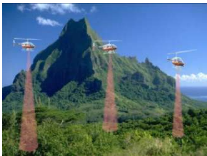
Fig. 2: Helicopter IR scanning of large forests

The IR radiometer is mounted in the helicopter [11,13] and, with the help of a deflecting plane mirror, by its field of vision scans (through the bottom hatch, along the helicopter motion routing) terrestrial surface of large forests, see Fig. 2.