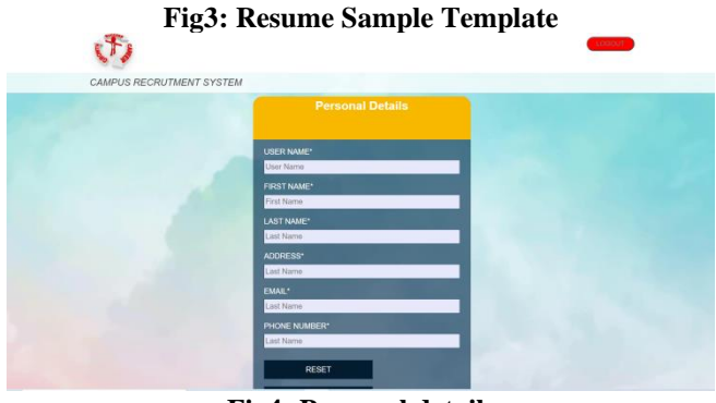
Fig4: Personal details