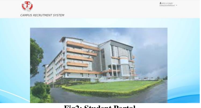
Fig2: Student Portal