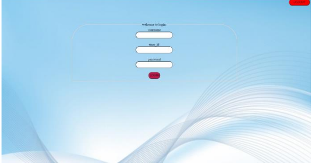
Fig1: Student Login