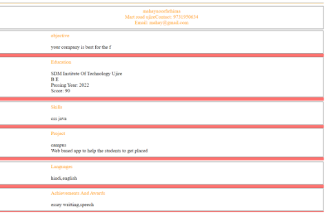
Fig5: Resume Converted To PDF