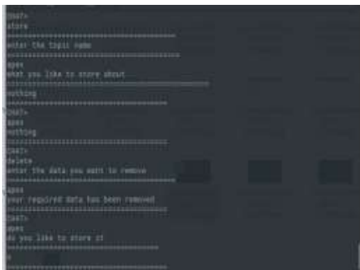
Fig. 16. Storing and deletion done by Chatbot

Here both the question 'color of the sky' and 'blue' is stored in question and answer format respectively in the store file. When asked second time the Chatbot first matches the exact words if not present then it goes for applying Natural Language Processing, calculating the frequency of each word matching and getting the maximum number which in this case maximum frequency is for 'color of the sky'. The answer in the store file for that corresponding question is 'blue'.