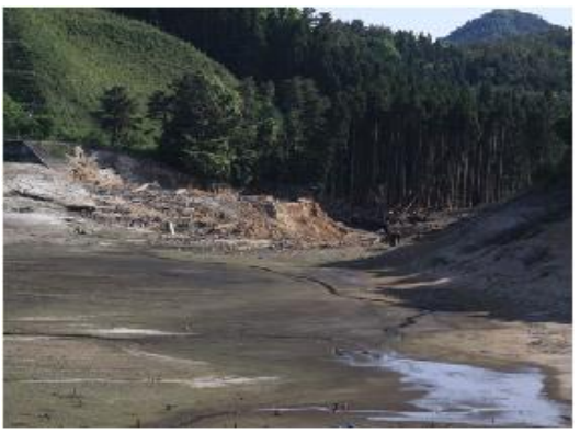
Fig.2 Dam failure at Fujinuma

water reservoir that in used for irrigation purpose [JCOLD, 2011]. The embankment dam started to fail after the earthquake occurred and completely destroyed during 20 minutes. Before the earthquake occurrence, the dam reservoir was full. The bank of 18 m height and 133m length failed just after earthquake occurrence. The dam was not designed under consideration of seismic forces.