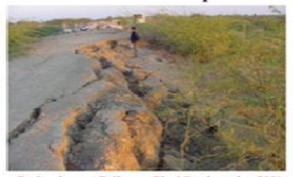
Embankment Failure - Bhuj Earthquake, 2001 Fig.3 Dam failure at Bhuj 2001

Another dam Fatehgadh Dam, constructed in 1979, is an earth dam with a maximum height of 11.6 m and crest length of 4050 m and the Fatehgadh Reservoir was nearly empty during Bhuj Earthquake. However, the alluvium soils underneath the upstream portion of the dam was saturated at that time. Bhuj Earthquake triggered failure near the bottom portion of upstream slope (EERI 2001) possibly because of localized liquefaction near the upstream toe of the dam. The EERI (2001) also found cracks as deep as 1.5 to 1.7 m within the upstream portion of the dam and instability near the top portion of the downstream slope following the earthquake. The problem of appearance of longitudinal cracks may indirectly relate to liquefaction of foundation soils.