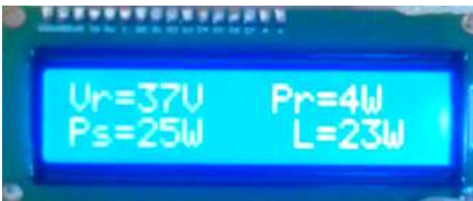
Fig.9. Company location power reading from sending end through PLC

Using the circuit diagram as shown in Fig.5, we have successfully tested the transferring of the signals from the customer location circuit and getting of corresponding signals at the company location, this result can clearly observed in the Fig. 8 and Fig. 9. The photo snaps of such implemented results are shown in Fig. 6 to Fig. 9.