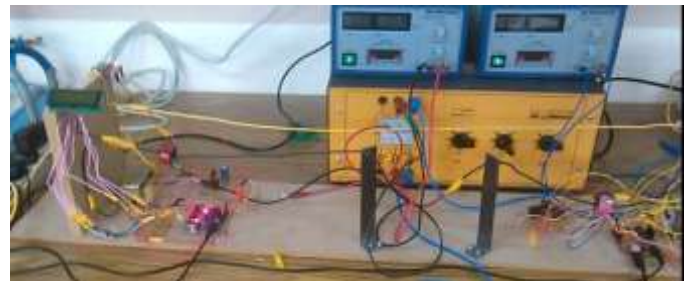
Fig.6. Intial stage of development