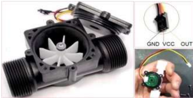
Fig.3. Arduino Compatible Water Flow Sensor (YF S201)