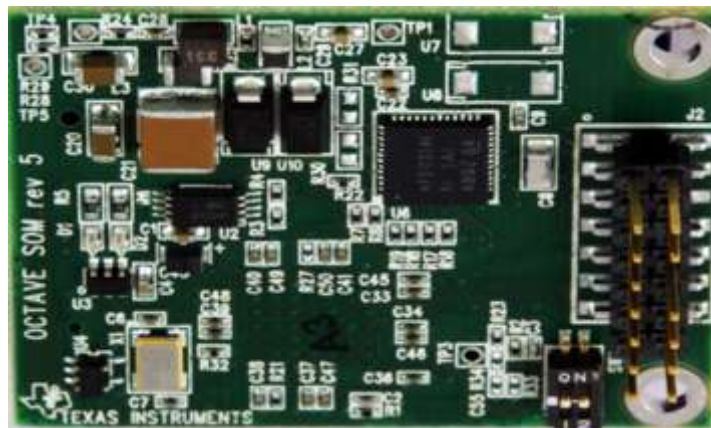
Fig. 2: SOMPLC-F28PLC83System on Module for Power Line Communication

send an alert message of usage of electrical energy and water. When company database system is connected to internet, the usage of electricity and water information will be obtained by the customer and company personnel.