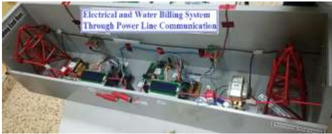
Fig.7. Finally imlemented prototype model