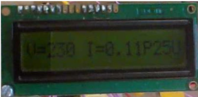
Fig.8. Customer location power transferring through PLC