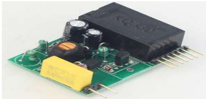
Fig.4. KQ-130F power line carrier data transceiver module