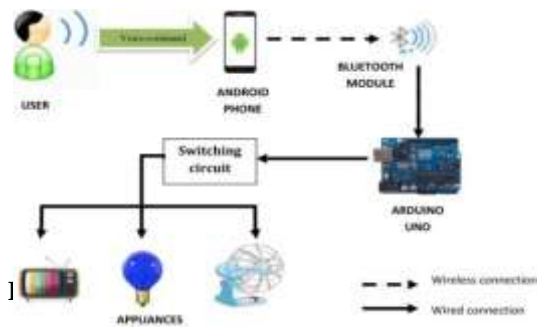
Fig 3. FlowChart of Working Module