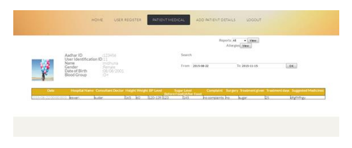
Fig 4: Doctor Counselling Report.

That means doctor will update patient details according to daily basic report and patient.