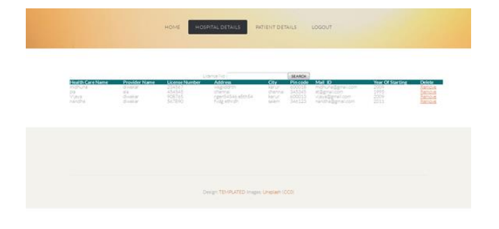
Fig 3: Uploading the Patient Data Set.

When a patient booked his doctor along with hospitality and Doctor Specialist.