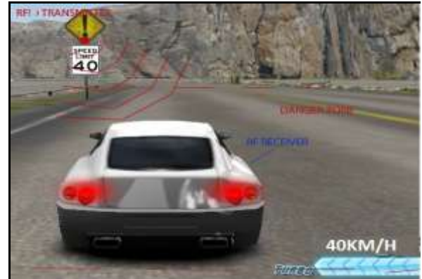
Fig. 1. RF transmitter/receiver antenna on signboard and vehicle respectively.

A constant acceleration i.e., a fixed speed is maintained as per local area selected. When vehicle is out of the restricted, the proposed mechanism goes to its idle position and thereby letting the drive as per his required speed. In this way, it reduces all the drawbacks of previously mentioned works and provides an effective and novel solution for speed control. It is simple and easy to implement the proposed work with reduced cost and handle the speed of vehicle in an effective way.