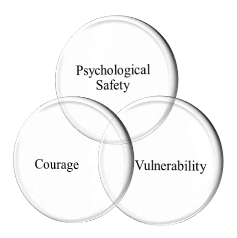
Figure 3 : Interconnectedness of Psychological Safety, Courage and Vulnerability.

The presence of these concepts can assist in the development of an individual and to upgrade their skills and abilities. In context of a group, it could help in knowledge sharing and achieving bigger accomplishments together when the people open up with their share of weaknesses and collaborate to overcome those weaknesses. The organization as a whole can benefit from the understanding of these concepts as the employees will then want to stay in the organization and it would reduce the attrition rate and result in the growth of the organization and can also enhance the organization citizenship behaviour.