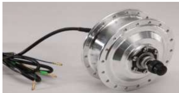
Fig- Hub Motor

Permanent magnets which are placed in a brushless DC motor, those magnets rotate around a fixed armature. An electronic controller replaces brush assembly of brushed motor turning. Brushless motor has more advantages than DC motor which includes more torque more weight and also torque per watt.